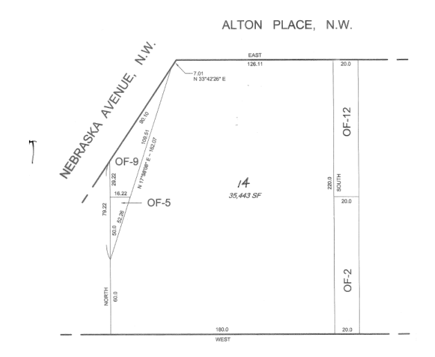
Excerpt from 2011 Subdivision Plat (Book 205, Page 134)

Approximately seven feet of Lot 14 also fronts on Nebraska Avenue, N.W. The total land area is 35,443 square feet, or seven times larger than the average of the other five lots on the square.