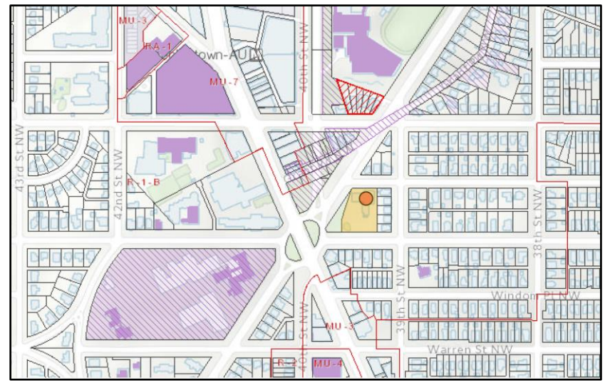
Excerpt from Property Quest map showing size of lots in vicinity of WABC site (www.PropertyQuest.dc.gov)

The lot is an irregularly shaped, five-sided parcel that spans the full depth of the lot, which is 220 feet deep on its east side. The west property line is angled and is also approximately 220 feet in length. The site fronts on both Alton Place, N.W., and Yuma Street, N.W., with 126.11 feet of frontage to the north (Alton Place) and 180 feet of frontage to the south (Yuma Street).